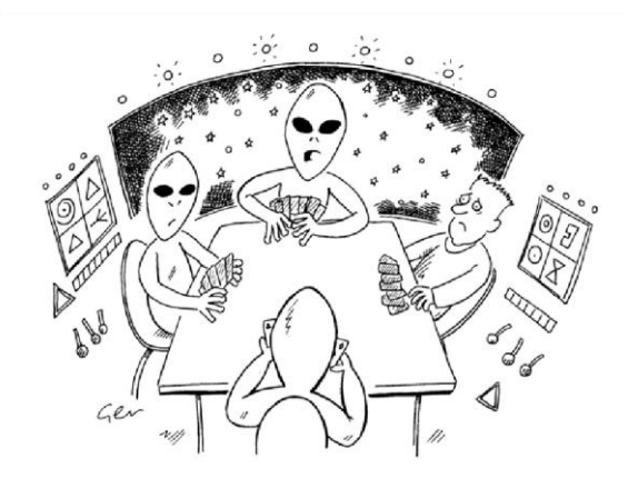
"Of course we're not going to experiment on you - we just needed another hand for our bridge game!"

Some big events occurring at QCBC over the next few months will see some sessions cancelled and apologies in advance.